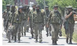
Three militants killed in Srinagar

during pandemic Bandipore: Darul Uloom Raheemiyah Relief Cell Bandipore has been providing relief and assistance to people during the present pandemic.